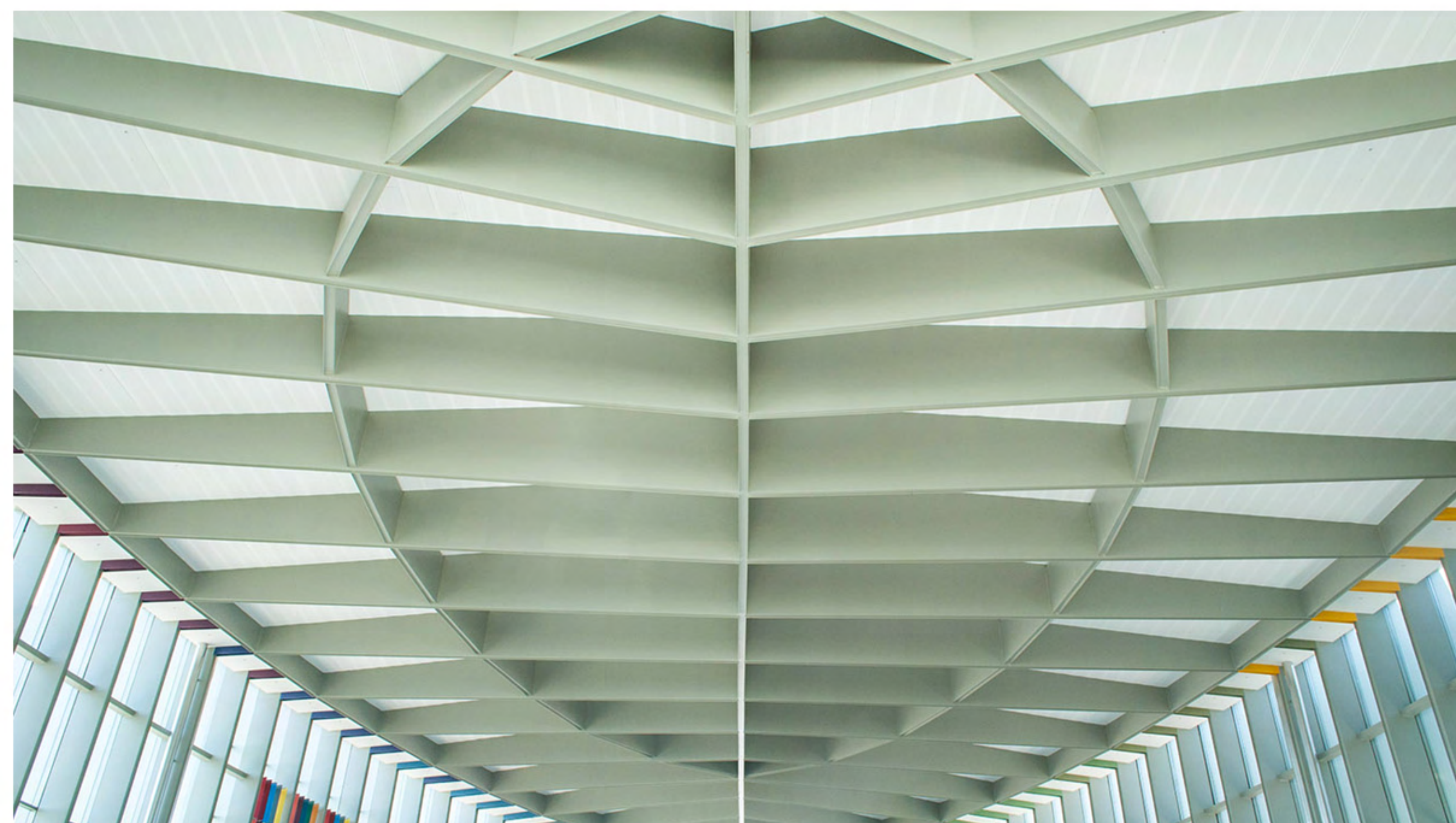
Terminal East - ABIA