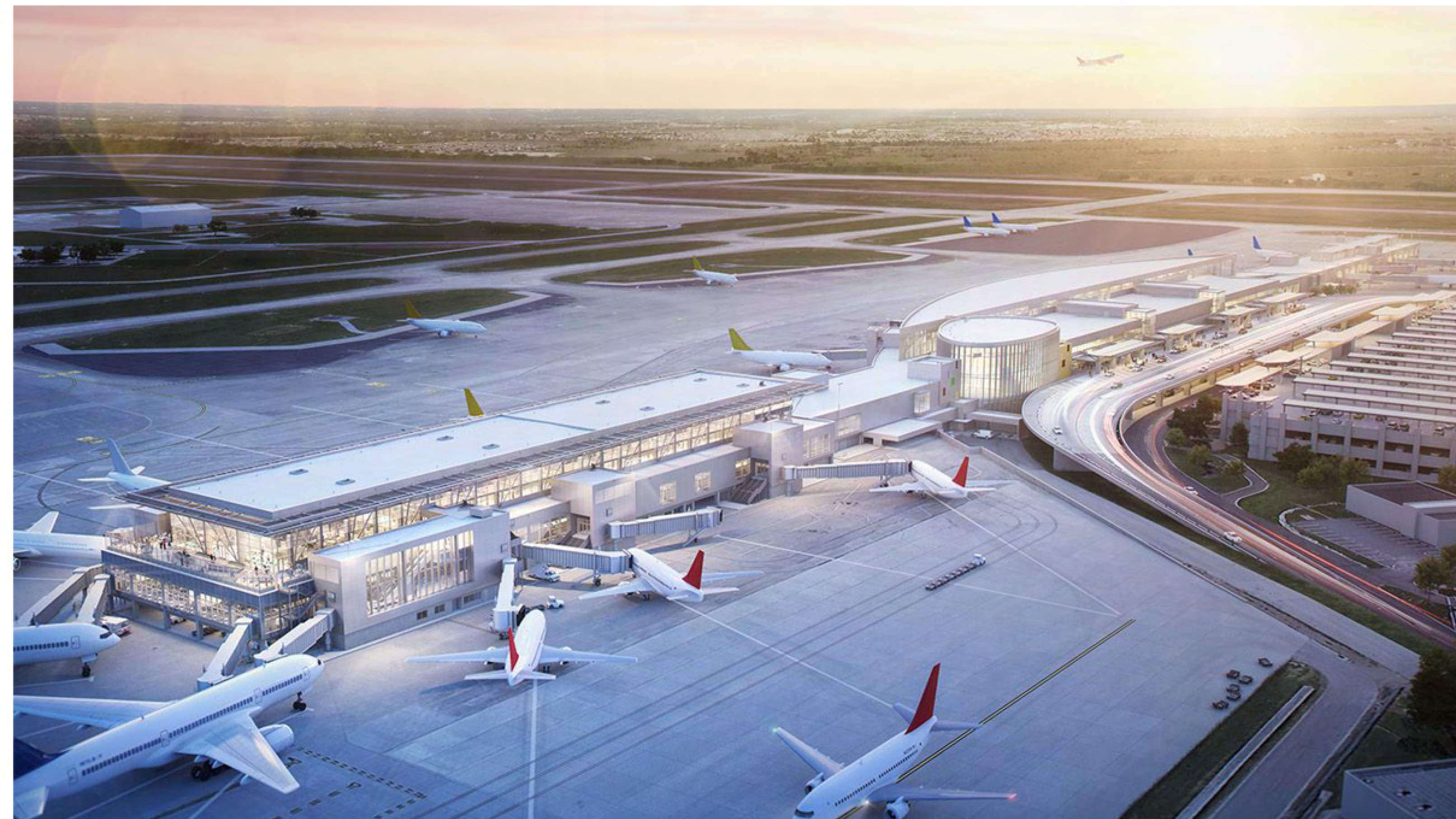
Austin-Bergstrom International Airport