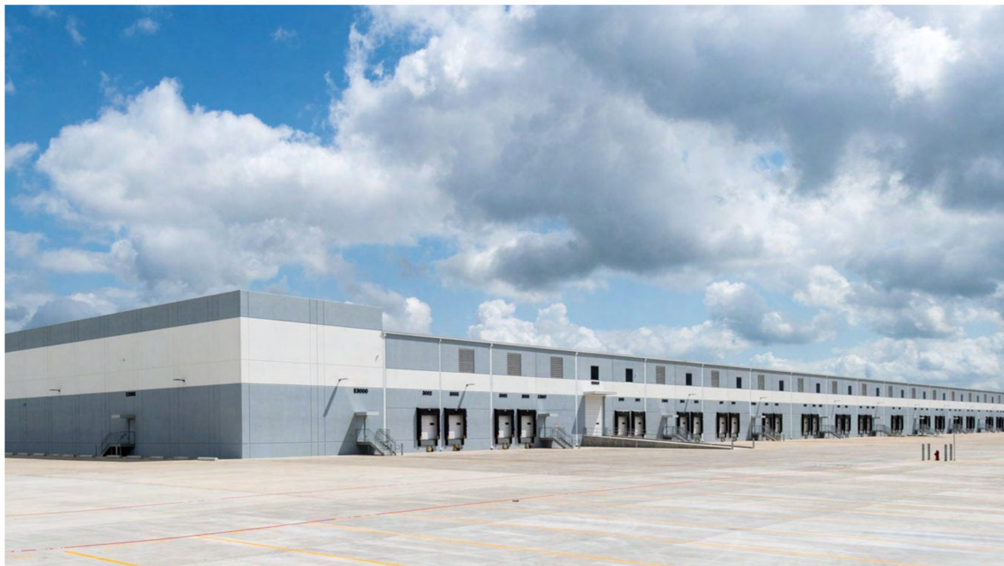
Prologis Carrier STX2