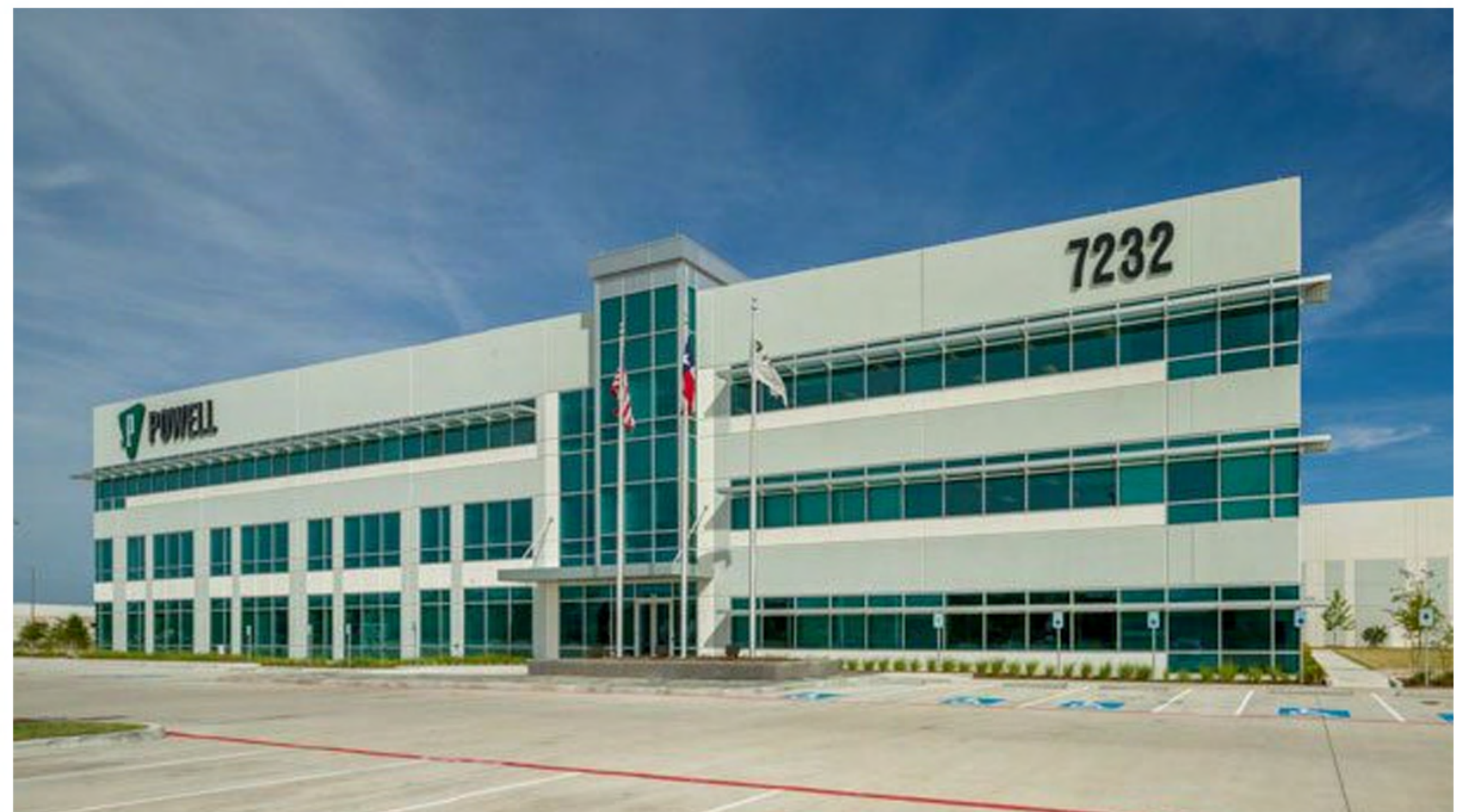
Powell Electrical Systems